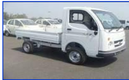
ACE - Fuel Efficient