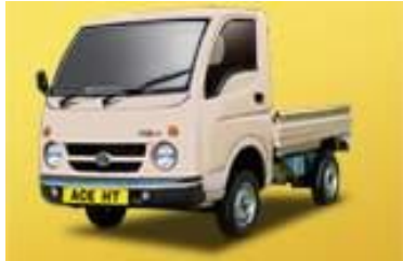
ACE 0.75 Ton