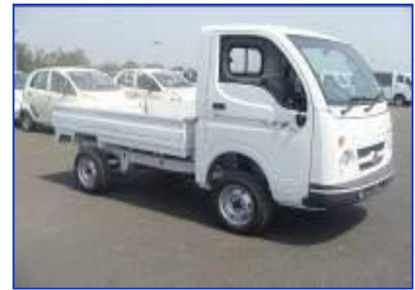
FE – Fuel efficient