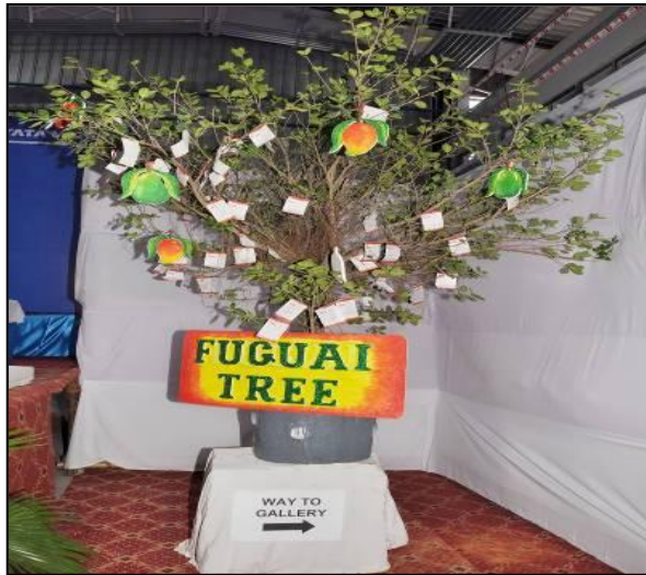
Fuguai Tree with fruits after clearing abnormalities