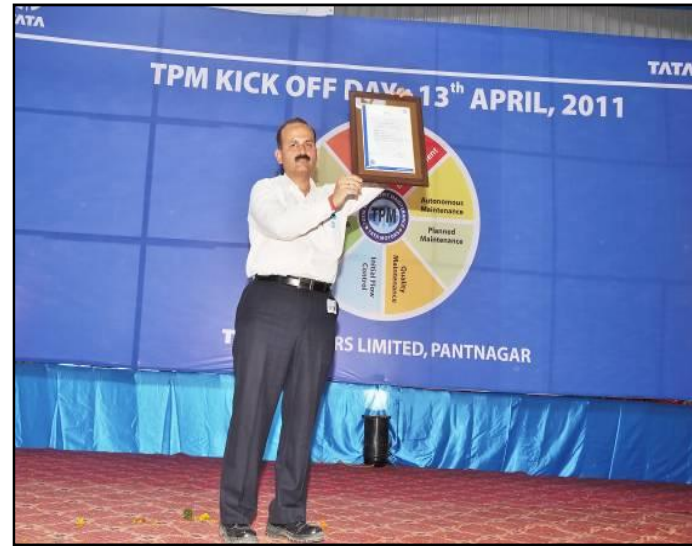
Plant Head unveiling TPM policy