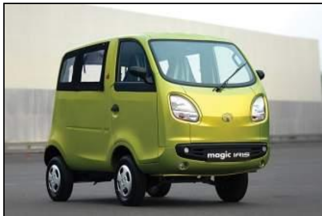
Magic - IRIS