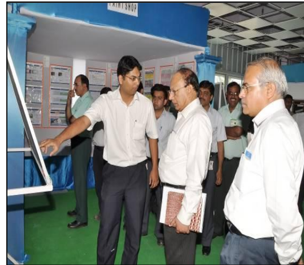
Seniors at the stalls