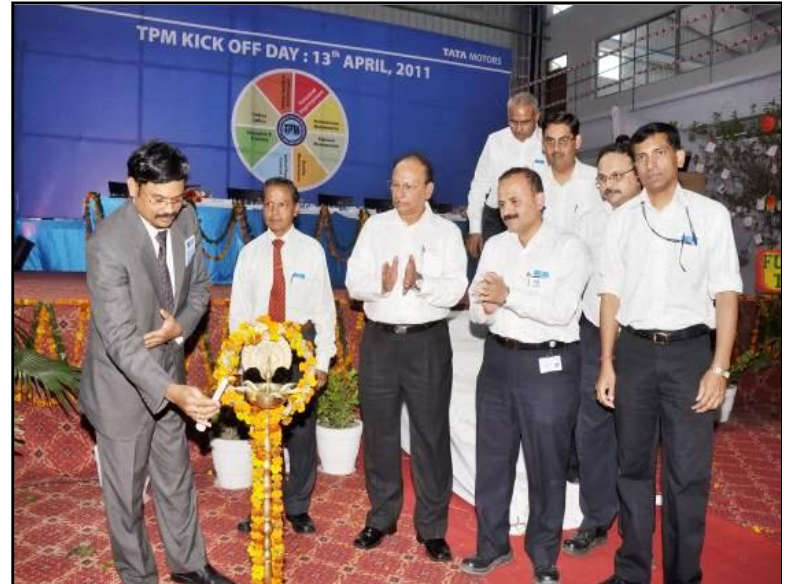
Dignitaries lighting the lamp