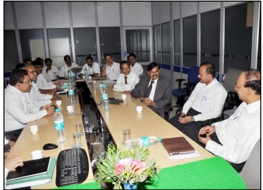
Meeting with Senior Management