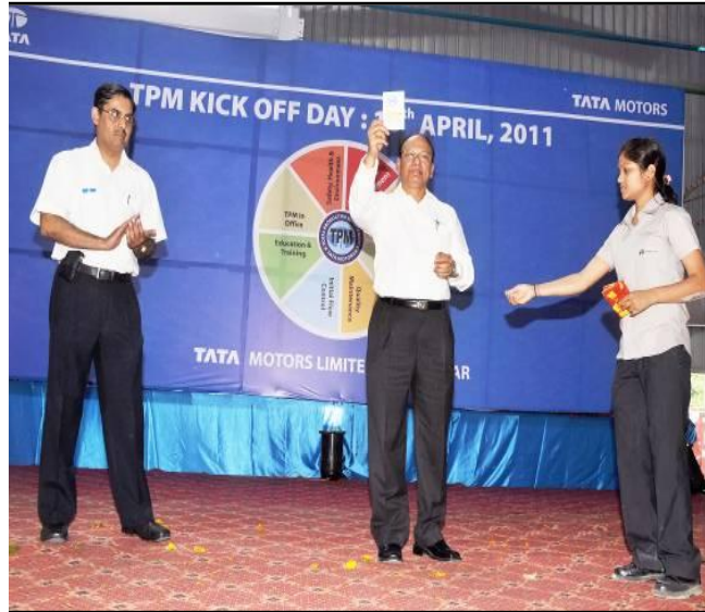
Sr. VP Manufacturing releasing TPM Pocket Book