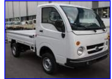
ACE - LHD