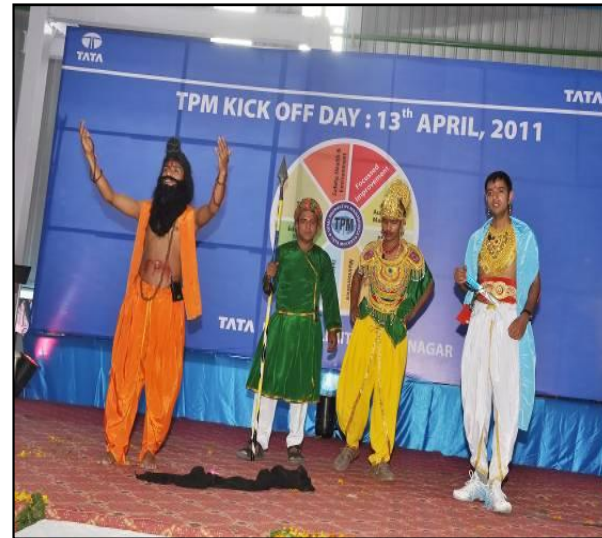
Skit by Team War between Pantnagar & Lalkuan