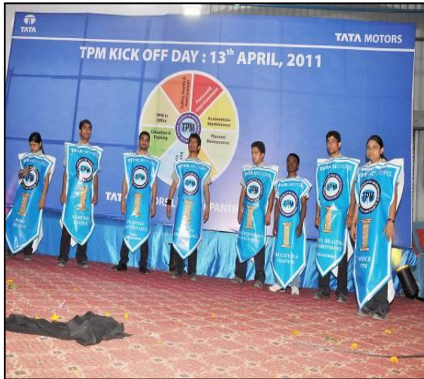
Skit by Team depicting Eight TPM Pillars