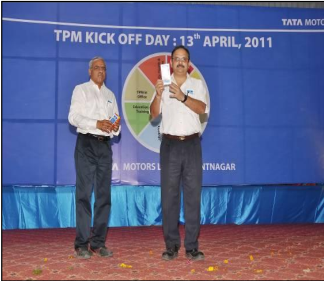
Mfg. Head unveiling TPM Pocket Card